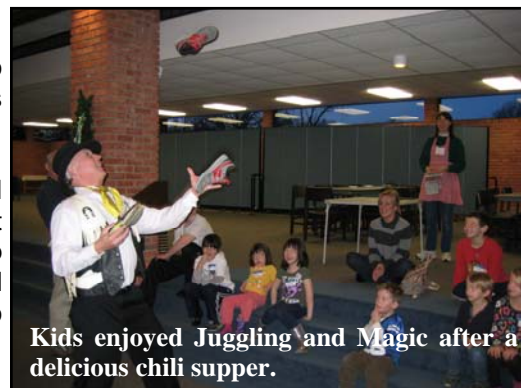
Kids enjoyed Juggling and Magic after a delicious chili supper.

Thank you to all including our parish staff, maintenance men, and attendees who contributed to the success of the day! The event is not planned as a fundraiser, only a “fun” raiser for the parish! The Women’s Club donates all its proceeds to the ongoing operation of the Club, the Parish and at least 10% of all funds to outside charities each year. Thanks to all who attended this event! Photos are on our website, under Community Life.